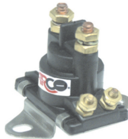
Solenoid Mercruiser, Mercury, Isolated base, 12 Volt.

Replaces Sierra P/N 18-5816 ORDER NO. 850-SW054 Mfr. No. SW054