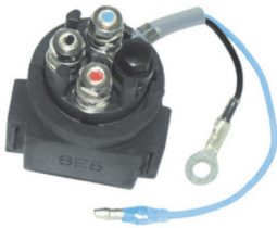
Relay Yamaha Outboard Tilt/Trim Relay