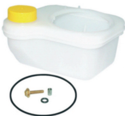
Mercruiser Reservoir Kit Replaces Mercruiser. Includes reservoir, cap, O-rings, mounting screws.