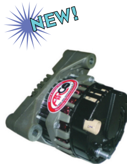
Volvo Penta Alternator Volvo Penta, 12 Volt, 75 Amp, 50-mm multi-groove. Serpentine pulley included