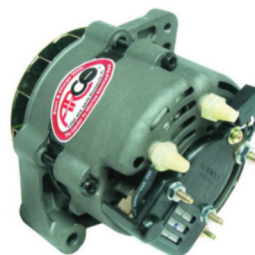
OMC Alternator O.M.C. Cobra. Replaces: Prestolite/Motorola, 12 Volt, 55 Amp, internal regulator, negative ground, 2-inch mounting foot, single groove pulley included