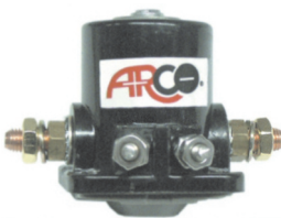
Solenoid BRP-OMC, Isolated base, 12 Volt

Replaces Sierra P/N 18-5817 ORDER NO. 850-SW058 Mfr. No. SW058