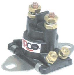
Solenoid Mercruiser, Mercury, Isolated base, 12 Volt

Replaces Sierra P/N 18-5816 ORDER NO. 850-SW054 Mfr. No. SW054