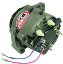
Mercruiser Alternator Late model Mercruiser, 12 Volt, 55 Amp, Internal regulator. 2-inch mounting foot, Single groove pulley included.