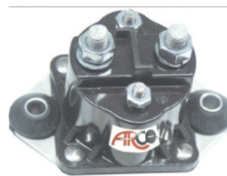
Solenoid Mercury /Force, Isolated base, 12 Volt.

Replaces Sierra P/N 18-5808 ORDER NO. 850-SW622 Mfr. No. SW622