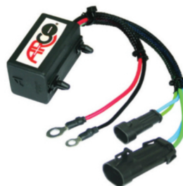
Relay EVINRUDE E-TEC. O/B Tilt /Trim Relay