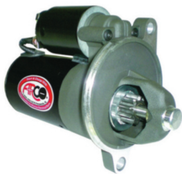
Ford Inboard Starter 302, 351 FORDS