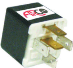
Relay BRP-OMC. 12 Volt, 30 Amp