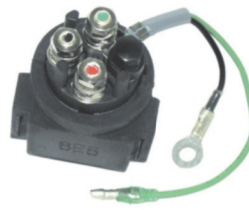
Relay Yamaha Outboard Tilt/Trim Relay