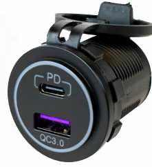
3.0 USB & USB-C Power Socket Unilluminated 424-26510