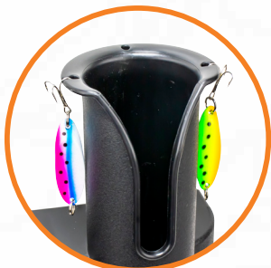
16 Lure & Tackle Ports