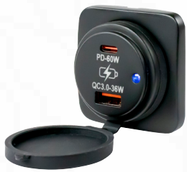
Square Surface Mount 3.0 USB & USB-C Power Socket 424-26531