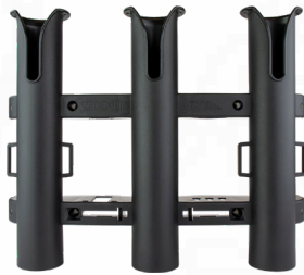
Triple Threat Three Pole Rod Holder, Black 423-25033