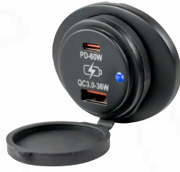
Oval Surface Mount 3.0 USB & USB-C Power Socket 424-26535