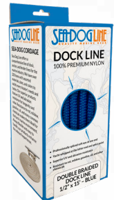
New Cordage Packaging Coming Soon!