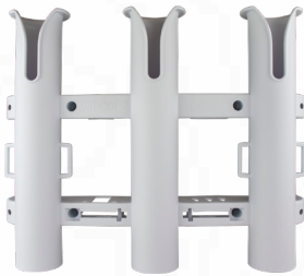
Triple Threat Three Pole Rod Holder, White 423-25032