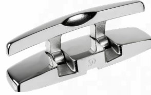
Rectangular Folding Cleat W/Hidden Hex Bolts 5" 420-41135 6" 420-41136