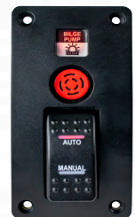
Bilge Pump Water Alarm Panel W/Switch 424-23037