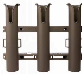
Triple Threat Three Pole Rod Holder, FDE 423-25034