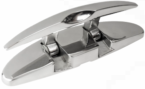
5" Oval Folding Cleat W/Hidden Hex Bolts 420-41115