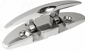
5" Oval Folding Cleat W/Thru Bolts 420-41125