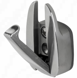
Fender Hook 426-72560