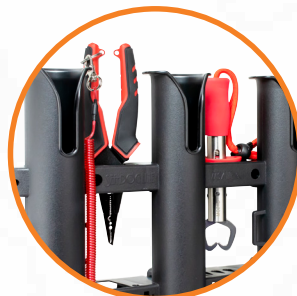
Multiple Tool Holders